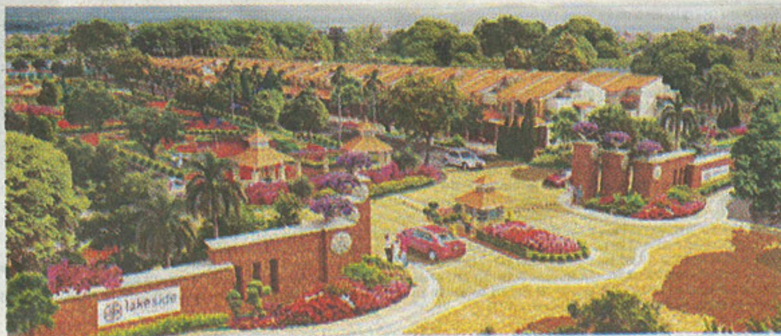
Artist's impressions of Lakeside Residences

side Residences marks Glomac's debut in the Puchong area.